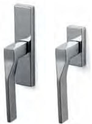
C216S - fixed window slider