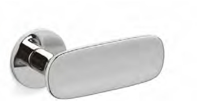
Conca - M236