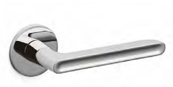
Adamant - M216