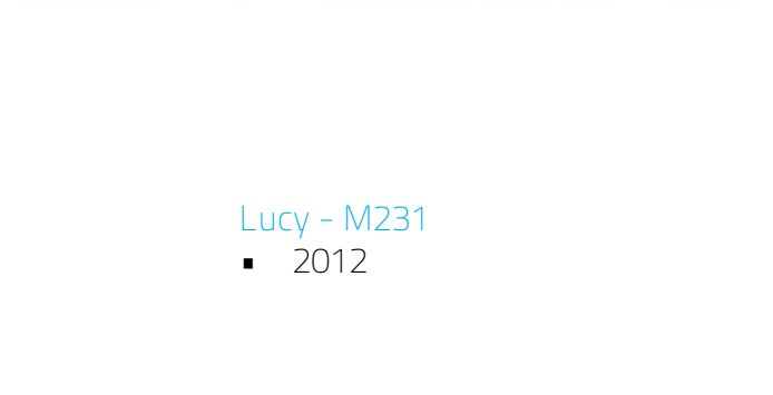
Lucy - M231